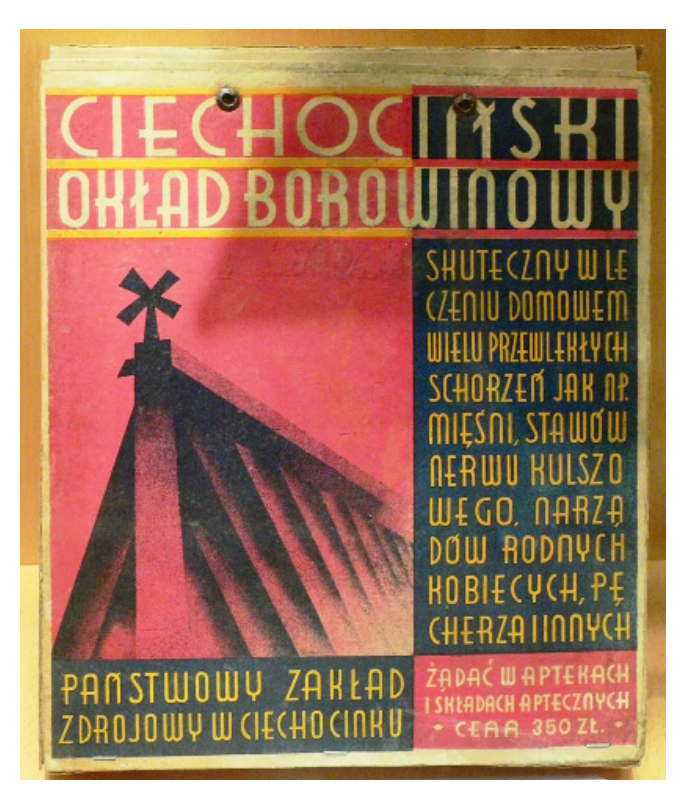
8. Motive of stylized graduation wall on paper warpping of therapeutic peat compress, Ciechocinek, late therities.

was stolen soon afterwards and the perpetrators have remained undetected. A picture story on "Zdrój Ciechociński" front page from October 2003 shows photos of the facility in ruins<sup>21</sup>.