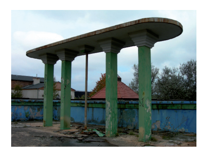
6 . The saline cascade in October, 2007.

determined on the basis of ca. 4 m² of water area per person in the adult bathers' pool, 8 m² per person in the swimming and diving pool, 2.5 m² per person in the children's pool; 1 square metre of beach space per adults and children alike; 20 m² per adult in the sports grounds and 10 m² per child in the playground. Consequently, the capacity of changing rooms was established at 676 for women and 394 for men, respectively¹².