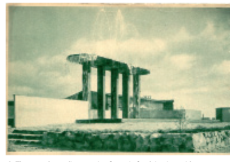
4. The cascade - saline aeration fountain for deironing, with the sand beach terrace below (Picture postcard from A. Nocna's collection).

former baths is adjacent to CKS "Zdrój" football grounds on the left and unattended green areas on the right.