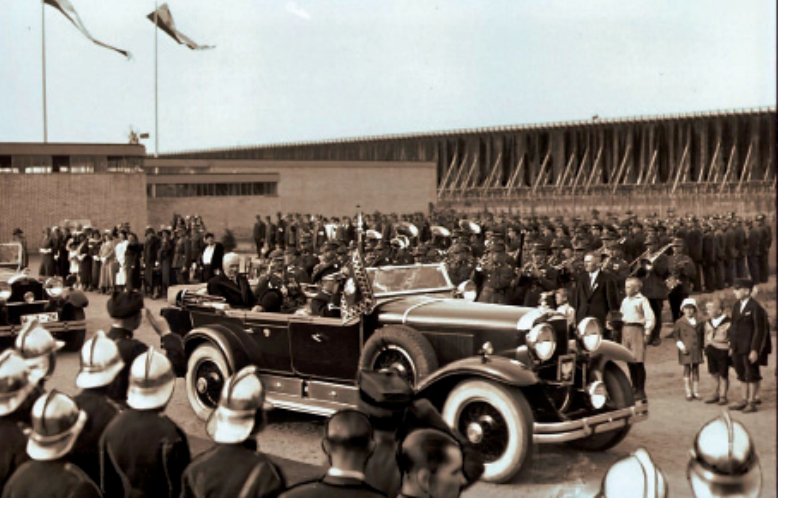
2. President Ignacy Mościcki departs after the inauguration ceremony on 4 June, 1932. Graduation tower 1, and the men's changing-rooms wing in the background.